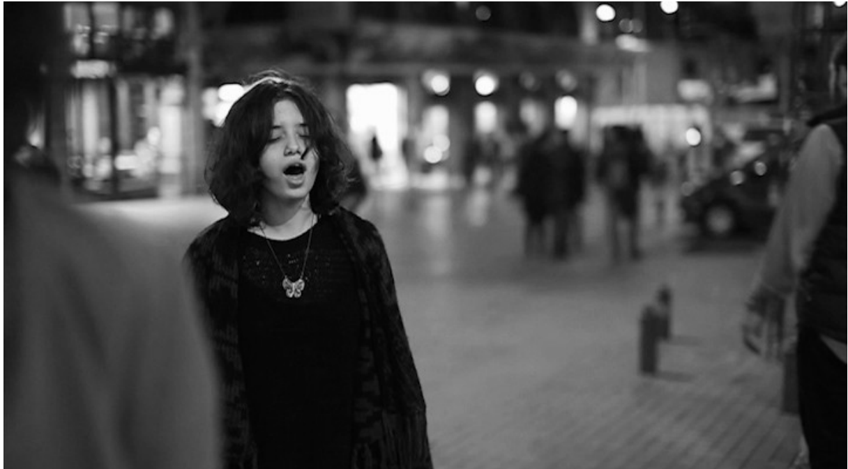
Song of Resistance – concert in Istanbul 2015, in collaboration with students-activists - still frame.

The sounds of Gezi Park – compilation of sounds, Burak Üzümkesci https://www.youtube.com/watch?v=E10MjVz6gdo